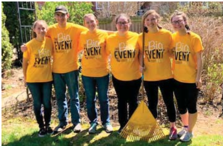
The Big Event — Towson University's largest day of community service took place on April 13. This is an annual student-run service effort with the purpose of saying thank you to TU's neighbors by providing free labor for outdoor projects. A number of LRV residents took advantage of this opportunity. Here a group of student volunteers take a break from gardening to show their TU pride. Thank you, students for your efforts!

The SmartCards Strike Again! Calvert Hall defeated Archbishop Spalding and Century in the playoff round of It's Academic. You can watch their victory on WJZ on May 25 at 10:00 a.m. Additionally, the Calvert Hall It's Academic team won the Catholic League Championship. They finished the 2018-2019 season 9-1 and have an astounding 56-4 record over the past 6 years.