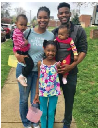
Scenes from the 55th annual Easter Egg Hunt on April 13th. This fun event is sponsored by the ALRV and the GLRRC.